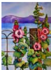
Banner Photo Credit: "Hollyhock Views" by Eva Nichols