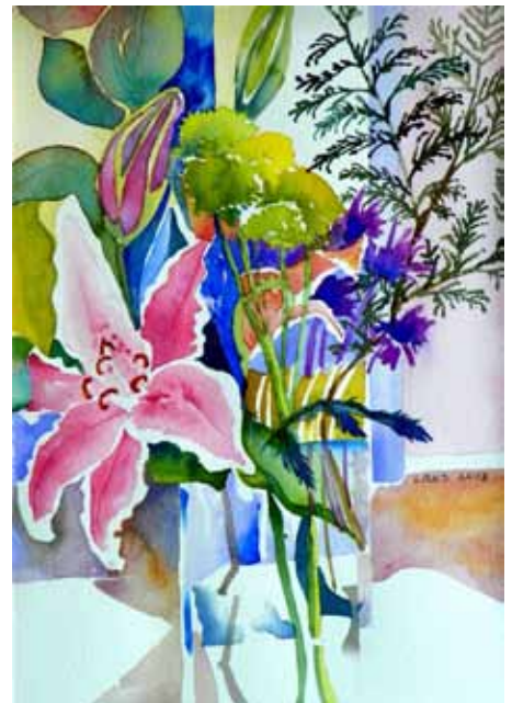
“Shirley’s Bouquet” by Lynn Schmidt is the post card image for the Bouquet’s to Reno’s 150th Birthday Exhibit

Please Note: Due to the large amount of Exhibit News, The MAY CHALLENGE can be found on page 5