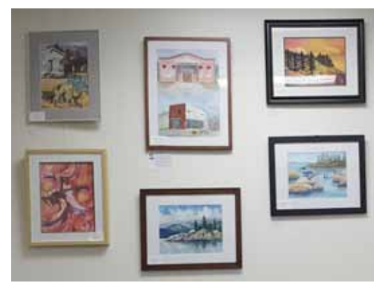
Some paintings at the North Valleys Library exhibit