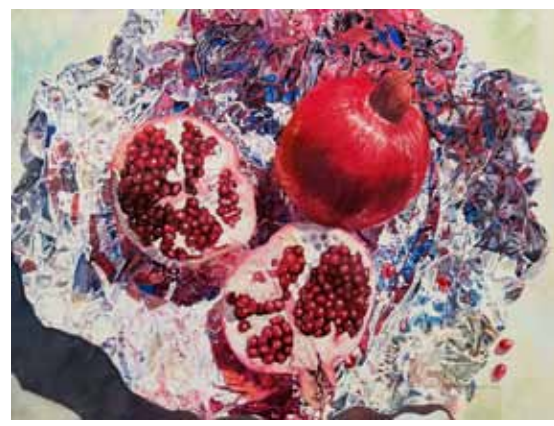
Diamonds And Rubies, 30" x 22"