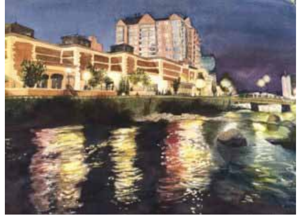
"Night Lignts" by Laurel Sweigart