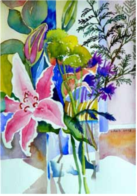
"Shirley's Bouquet" by Lynn Schmidt is the post card image for the Bouquet's to Reno's 150th Birthday Exhibit

All the paintings for the judged show will be upstairs. However, downstairs in the gift shop and adjacent area, artists entered in the judged exhibit may also display other work like miniatures, bin art, and greeting cards. Artists are especially encouraged to bring their miniatures - any age, any medium. Local festivals going on at the same time are: Hot August Nights (final two days), Sat & Sunday August 11 & 12; Dragon Boat Festival August 18; Rib cook off August 29 To Sept 3; Balloon Races Sept 7 -9; Air Races Sept 12-16, and Street Vibrations Sept 26-30. This will be a great show to get exposure to your work.